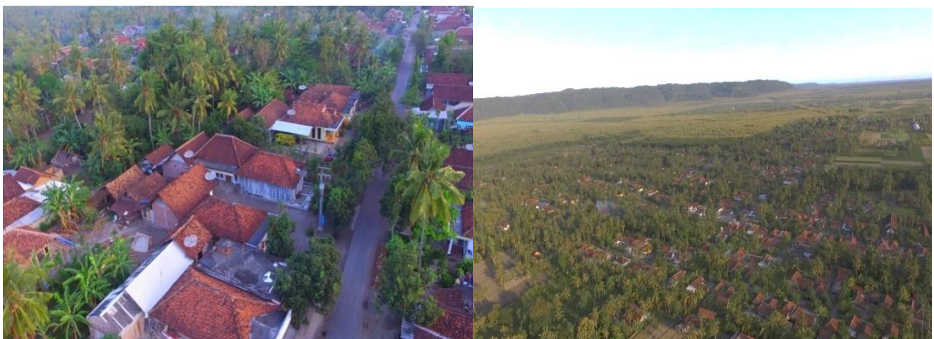
Land use in Pondokasem Hamlet