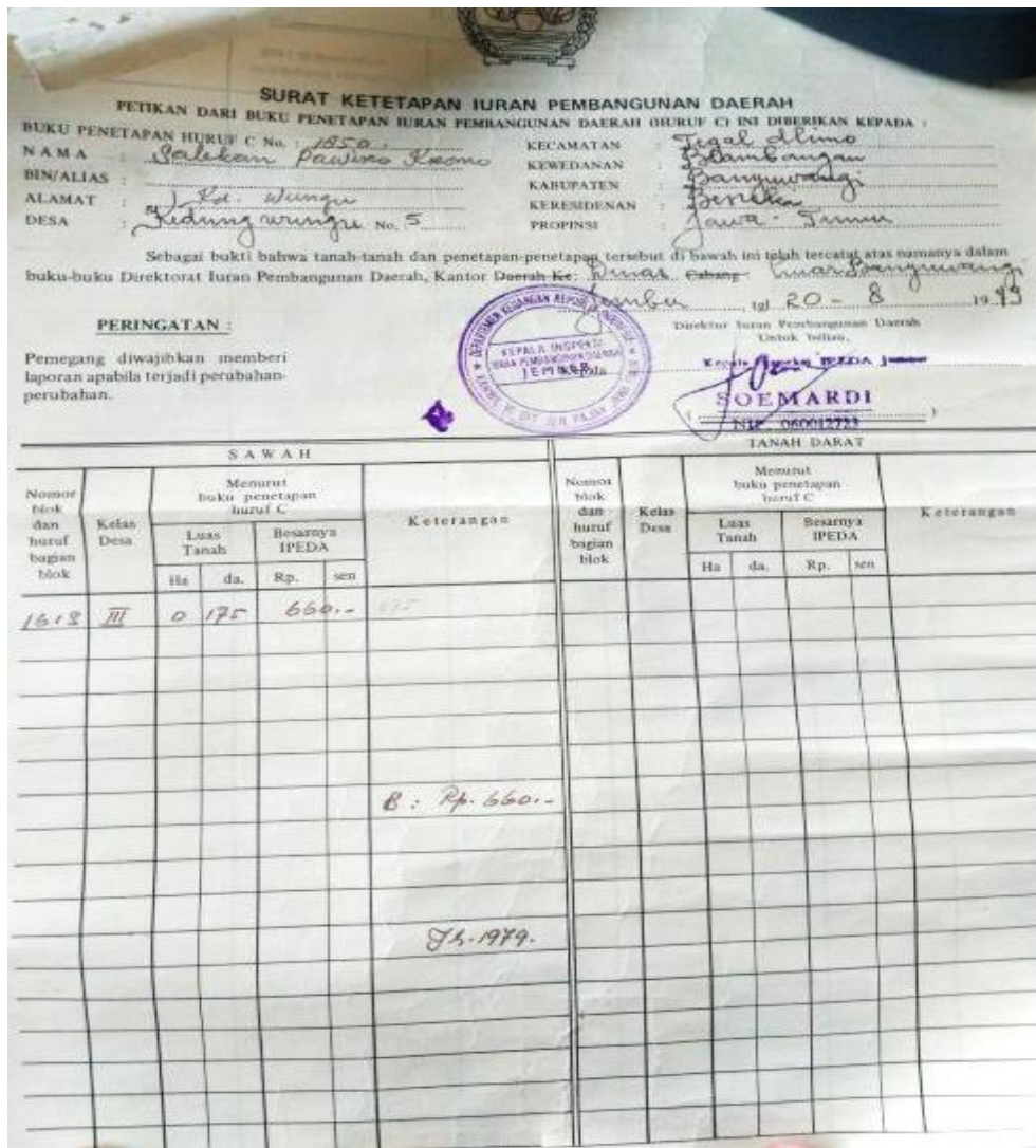
Regional Development Contributions in 1979