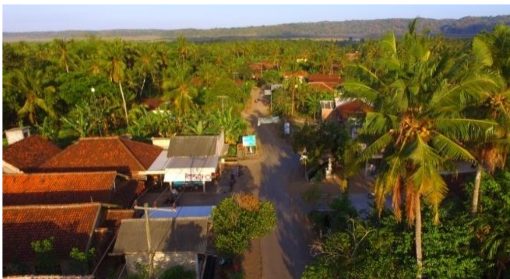
Figure 2. Land use in Pondokasem Hamlet

Observations made in Kedungasri Village, especially in Pondokasem Hamlet, found that there were 309 plots of land. From the 309 plots, 304 plots of land were mapped from the Kerawangan map and 5 other plots were mapped based on image interpretation. The results of field observations and image interpretation from the Kerawangan map are presented in the table. The tables presented in this article show two areas, namely the area based on the Kerawangan map and the area based on the mapping. The extent of this mapping is obtained from the interpretation of the image based on the Kerawangan map and the survey results. Here is a further explanation.