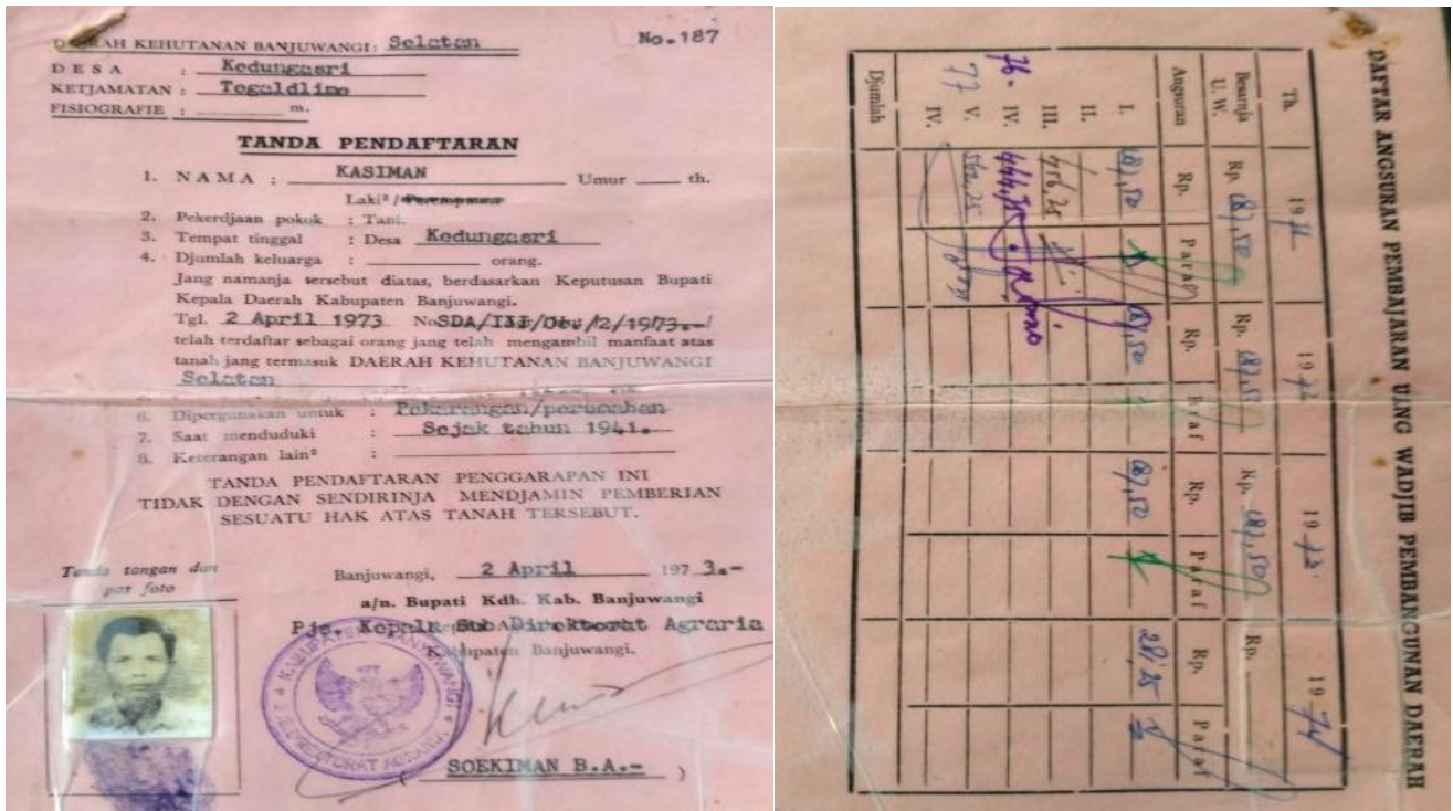
Registration mark issued in 1973