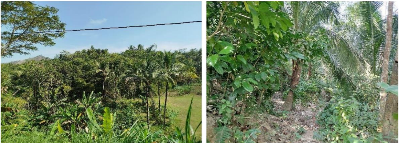
Figure 1. Coconut Trees in Gunung Kukusan Hamlet

pandemic compared to those producing granulated sugar." (AM, field staff, Year I and III, Kulonprogo Land Office).