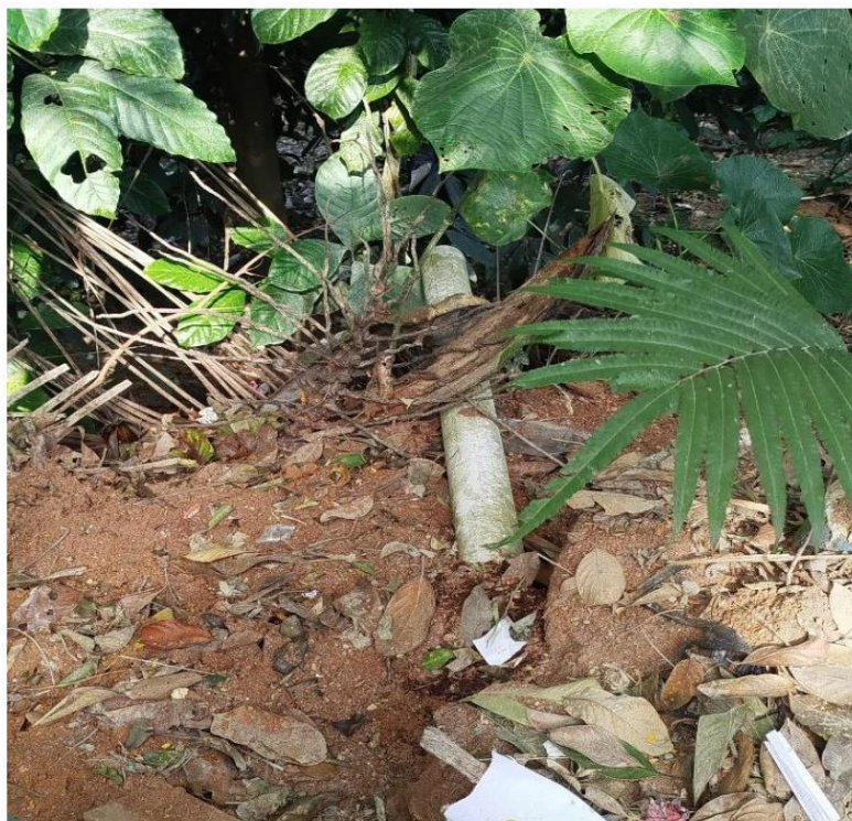
Figure 4. Domestic Wastewater Pipes Used for Irrigation

In their management practices, palm sugar farmers utilize traditional irrigation methods. They construct simple channels with hand tools, such as hoes, to collect rainwater and, during the dry season, irrigate coconut plantations using wastewater pipes from domestic sources. This method proves effective for irrigating plantations during both the dry and rainy seasons. The local morphology, characterized by limestone formations and hilly terrain, further influences the reliance on traditional irrigation systems. Implementing a piped irrigation system from municipal water supplies (PDAM) would demand significant financial and time investments.